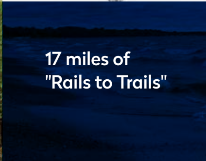
17 miles of "Rails to Trails"