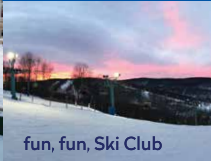
fun, fun, Ski Club