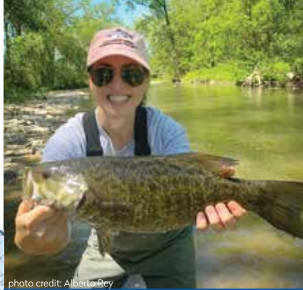
world-class fishing opportunities