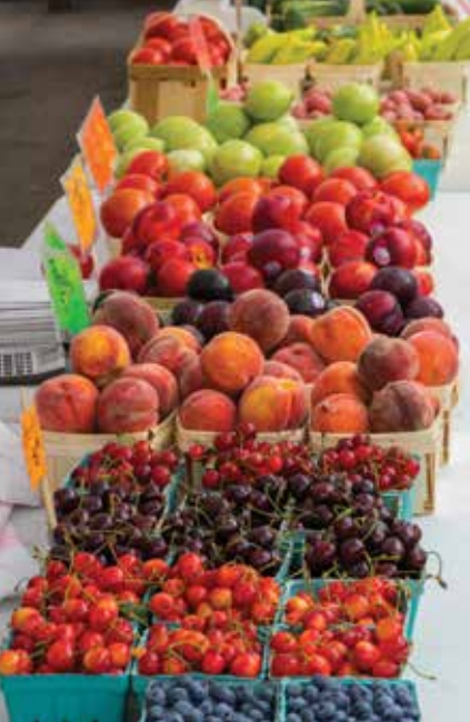
a bountiful farmers market