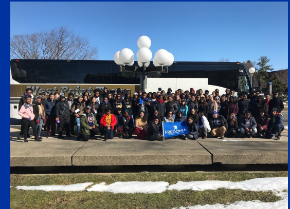
2018 Multicultural Weekend