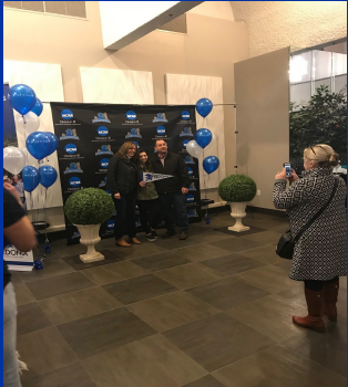
Incoming Fredonia students at a regional reception.

The office had a 96% completion rate of federal verification during 2018-2019.