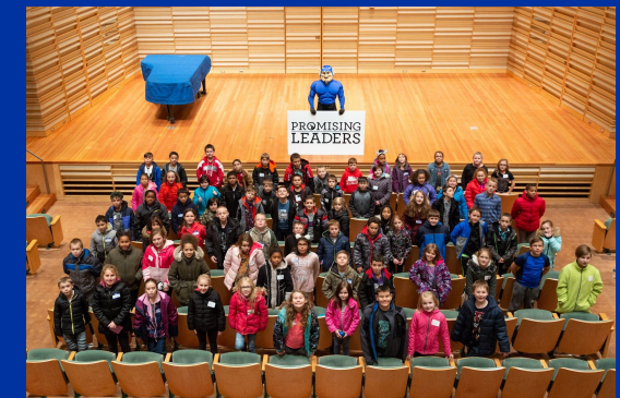
Elementary School Visitors for Pre-College.

D2D is a 2+2 partnership between Fredonia and JCC that provides students with a seamless transfer pipeline, while offering students an integrated residence experience at Fredonia.