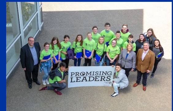
Promising Leader Signature Experience for regional 8-10th grade students.

(Email): orientation@fredonia.edu (Website): students.fredonia.edu/orientation